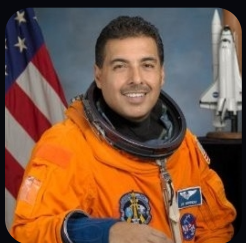
Dr. José M. Hernández

Former Astronaut, CEO at Tierra Luna Engineering, LLC